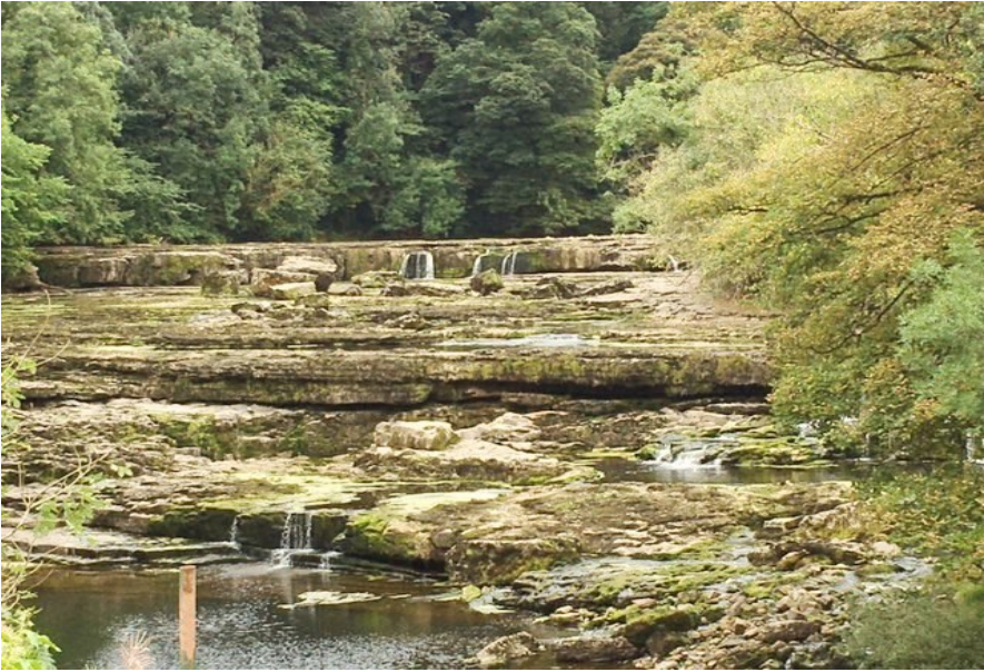
This could be another Mystery Picture!! Here is Aysgarth (lack of) Falls after a very dry September.