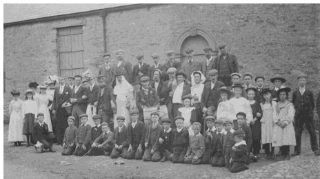
Feast gathering outside the old Town Hall

In the 19th century, the building now known as the Old Town Hall B&B, was built by Christopher Other of Elm House as a Drill Hall for the Wensleydale Volunteers. They practised their rifle shooting on the moor above the village. Later, the Town Hall became the focal point for village dances, concerts, teas, and meetings of the Band of Hope. A Village Band was formed