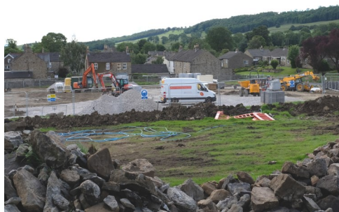
Views are being sought on house building in the National Park; in West Witton, 17 new homes are currently being constructed.

Full details of how to respond to the consultation are available at https://www.yorkshiredales.org.uk/park-authority/living-and-working/planning-policy/local-plan-2023-40/consultation-no-2-exploring-our-options-ambitions/ .