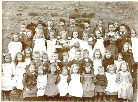
Photo of the children of Askrigg School 1906

drawings as we can. Dig out your old photos, take a new snap, draw a picture, get creative! Despite the Corona pandemic, with digital technology it's super easy to participate by taking photos on phones and uploading them online, it only takes a moment. We can't wait to see what people come up with!" Members of the public can participate by uploading their images to the project directly at thepeoplespicture.com/storyofschools/ .