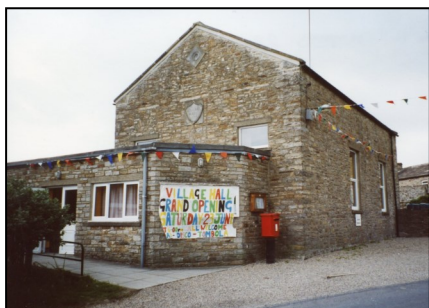
The new village hall grand opening