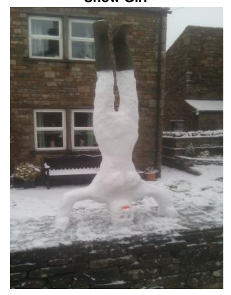
creativity in Stuart Dinsdale's family in Gayle