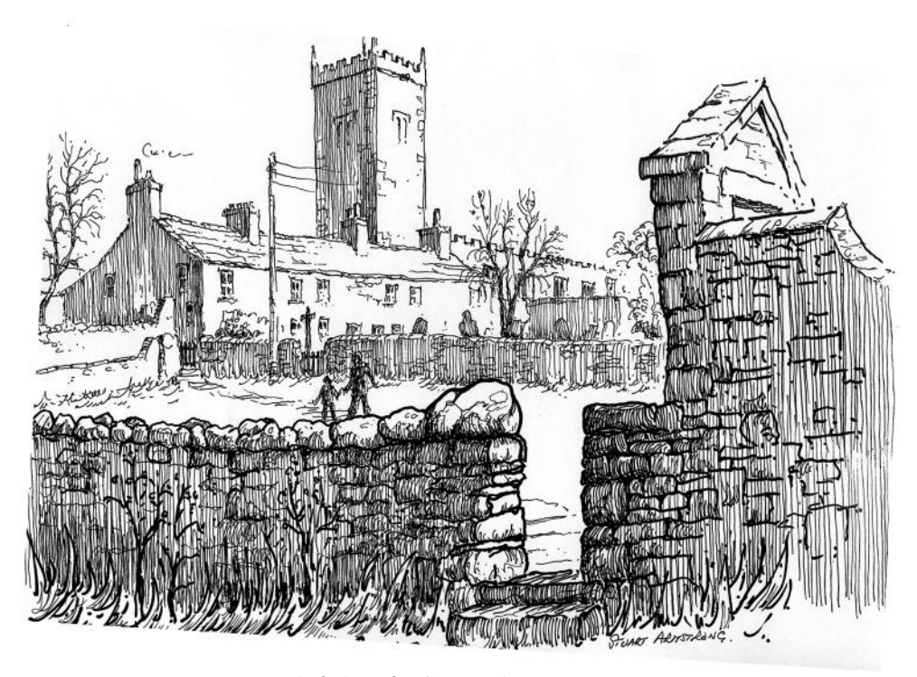
Askrigg, by Stuart Armstrong

Issue 223 Easter and April 2016 Donation please: 30p suggested or more if you wish