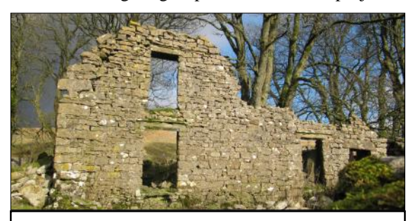
The remains of a house at Thorns.

This project gives us the opportunity to unlock its secrets and tell its story. We're very grateful to the landowner for giving us permission for the project."