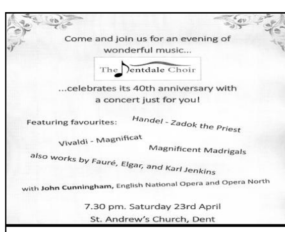
Tickets £7, £2 for children from Dent Stores, TICs at Sedbergh and Kirkby Lonsdale and Ingleton Community Centre