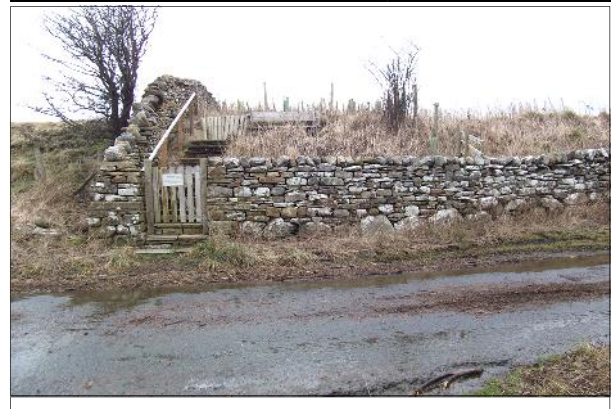
Mystery picture. Last month's was an etching of the original entrance to Lodge Yard, Askrigg,

Sat 02 Apr at 2.00 pm Frozen Singalong PG, 1 hr 42m. Adult £5, Child £2.50. Sat 02 Apr at 5.00 pm Coverdale: A Year in the Life Doors open from 4 pm, cafe will be open for drinks and cake. Tickets £5, booking is recommended. Sat 16 Apr at 7.00 pm Quiz Night Supper included. Tickets £6.50. Sat 30 Apr at 7.30 pm The Friends of Dave This acoustic duo play a wide selection of songs, from Jazz Standards to Neil Young and The Beatles. Tickets £6. Tel: 01969 624510 - Email: admin@oldschoolhouseleyburn.com Web: oldschoolhouseleyburn.com F: facebook.com/oldschoolhouseleyburn - Twitter: https://twitter.com/TLeyburn - Reg. Charity No: 1122092