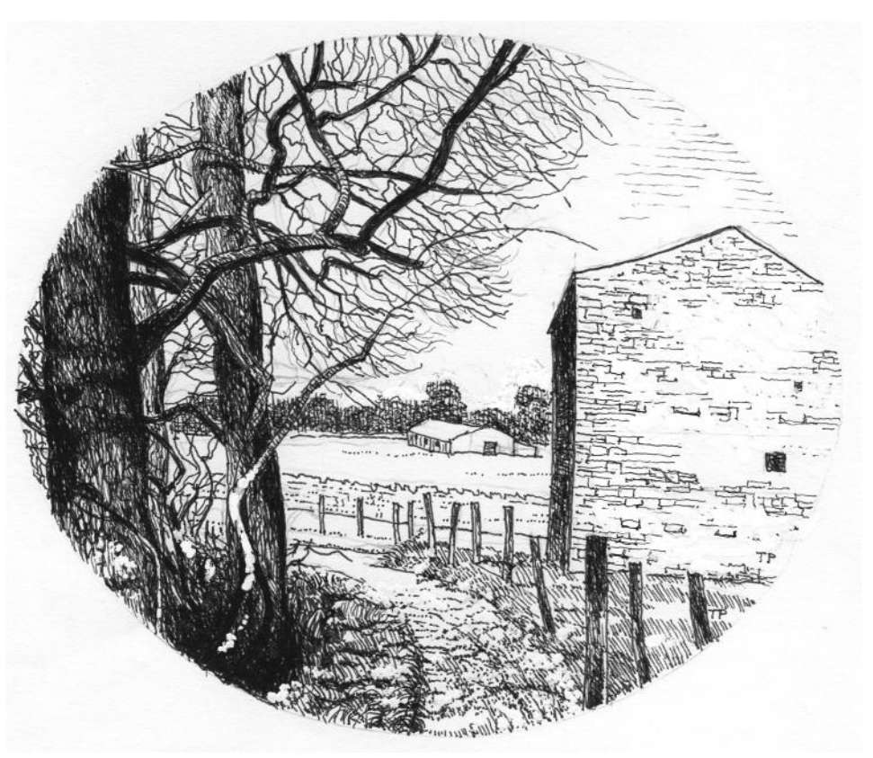
Footpath to Cotter Force; Tom Purvis

Issue 222 March 2016 Donation please: 30p suggested or more if you wish