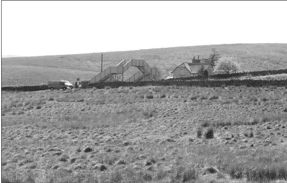
Mystery picture. Last month's was of the old Congregational Chapel in Bainbridge