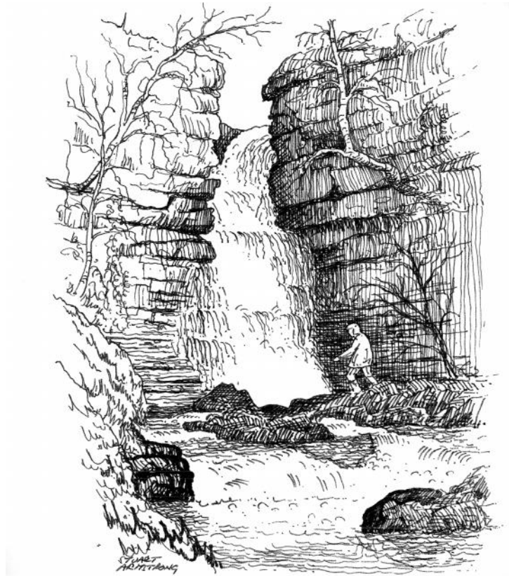
Mill Gill Falls, Askrigg

Donation please: 30p suggested or more if you wish