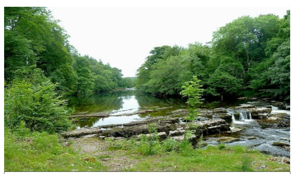
Mystery picture. Last month's was of the Lion's Head rock formation near the Dalesway and Conistone.