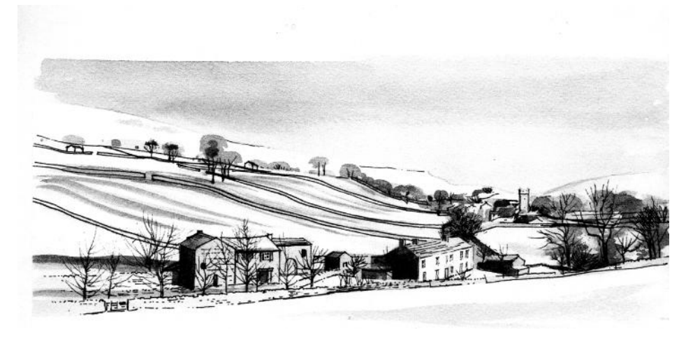
By Janet Rawlins

Donation please: 30p suggested or more if you wish