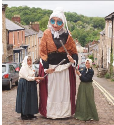
The photograph taken by Beki Harrison, shows the Giant Knitter of Fate prowling the streets of Richmond in search of Bartle!

information and tickets can be found at www.northcountrytheatre.com or by telephoning 01748 825288