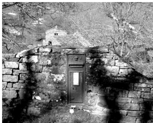
Mystery picture. Last month's was of the fancy handgate at the bottom end of the very narrow track/footpath (Shaw Lane), south of Gayle.