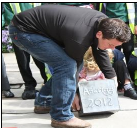
The lead casket goes in

Loads of volunteer effort went into both