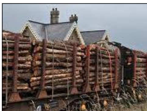
Ready loaded at Ribblehead

In some cases, where the intention was to