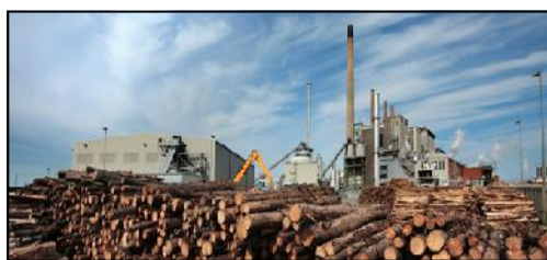
Sembcorp Biomass plant, Teesside

and hauliers. It covers all aspects of timber transportation including priority route maps, restrictions (avoidance of 'school-runs' for example), timing of movements, temporary permissions and discussion and work in advance to avoid damage to highways or property, or disruption.