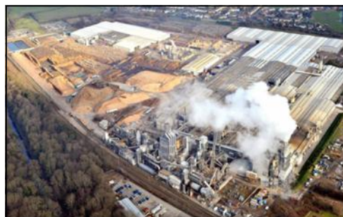
Aerial view of the Chirk works

bersome title is North Yorkshire Timber Freight Quality Partnership which is a liaison of local authorities, timber companies