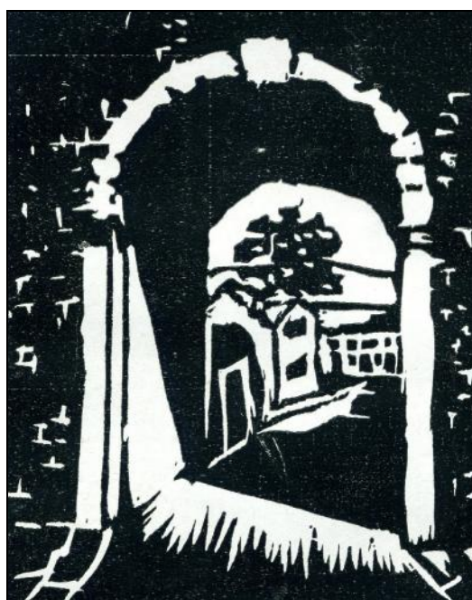
Mystery picture; it's changed a bit now! Last month's was of Bainbridge