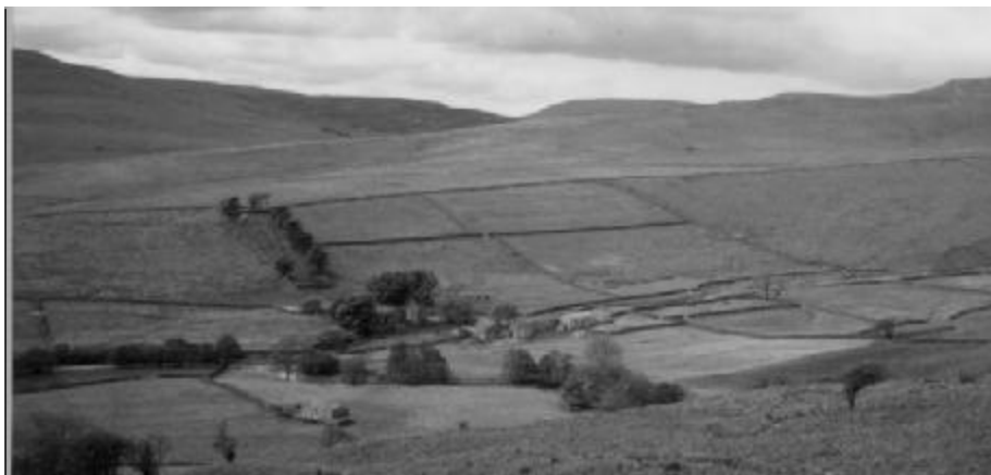
Mystery picture. Where is this isolated group of farm buildings? Last month: at the top of Aisgill Force above Gayle