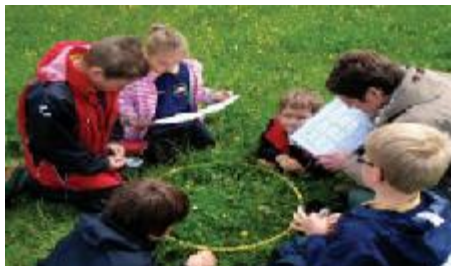
West Burton School Meadow Trip

The children were also fascinated to know that species-rich meadows like those at Colt Park can have over 30 different species in a square metre, and up to 120 different species in total, whereas in an improved meadow or silage field only a few different species may exist. For the last 20 years the hay meadows at Colt Park have been used for scientific research, so it was an ideal venue for the children to learn about the importance of hay meadows in providing a fodder crop for livestock, for their biodiversity, and their possible role in climate change mitigation.