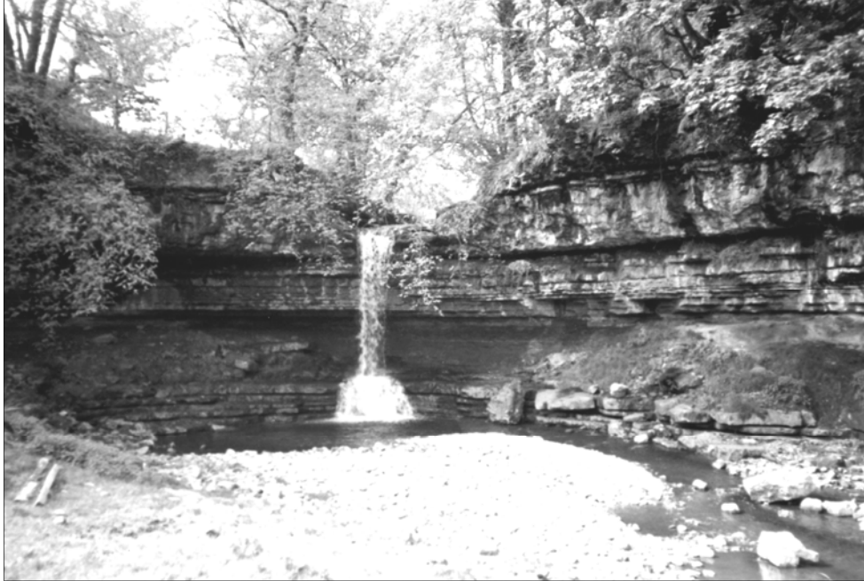
Mystery picture. Last month's was of Park Scar Waterfall at Stalling Busk. Now here is another local cascade for you!