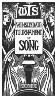
Tournament certifi- cate from the 1930s

The closing date for entries for the Wensleydale Tournament of Speech and Song in March is January 31st, 2009. The speech classes are from March 16th to 20th, and the music classes from March 23rd to 27th. For full details see www.dalesmusic.co.uk or in