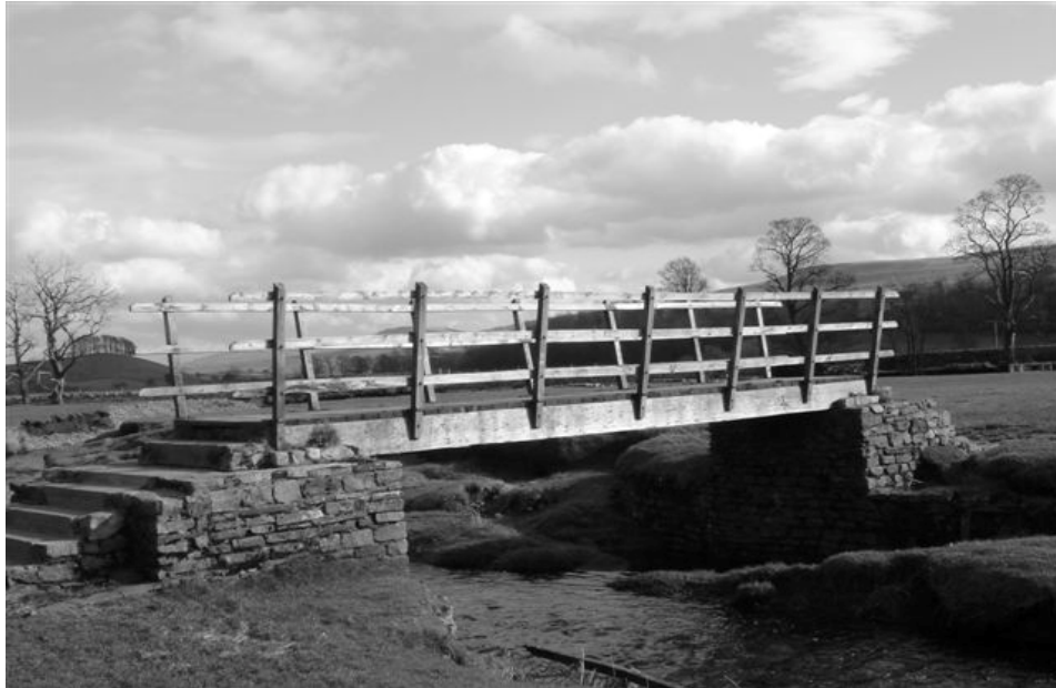
Where is this footbridge? Last month's mysteries (in the coloured middle pages) were of Lodge Yard, Askrigg, and the train crash was on Christmas Eve 1910 at Hawes Junction