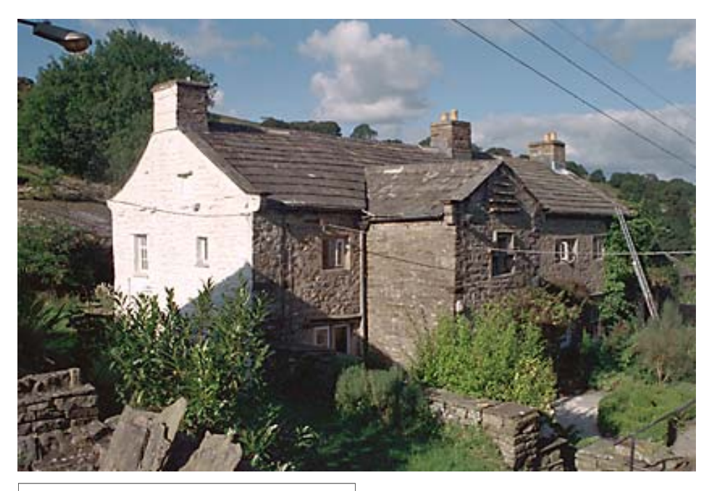
Mystery picture. See page 35 for replies