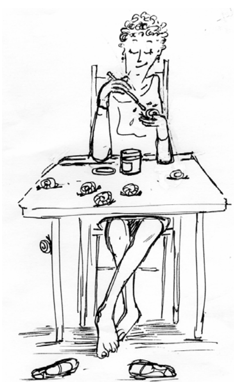
She took off her shoes and began to paint her snails